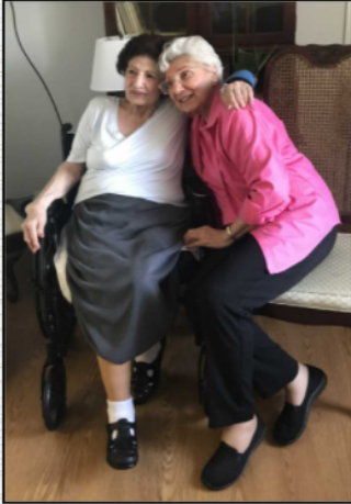
Separated by time and space but always together in spirit