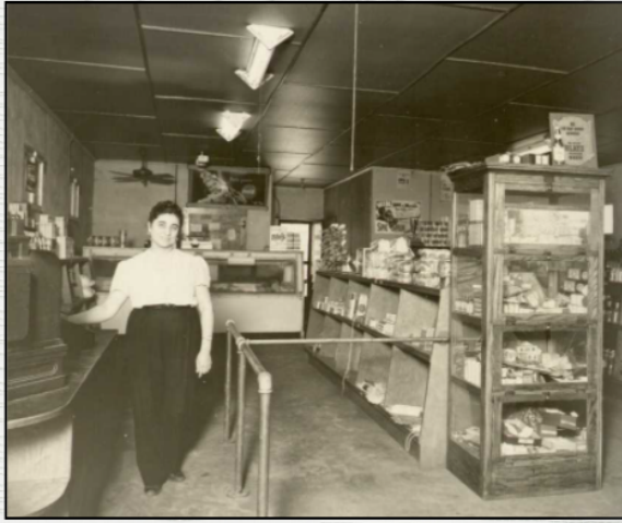
Mary's Store circa 1948